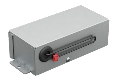
Hi - Res Image 🐜