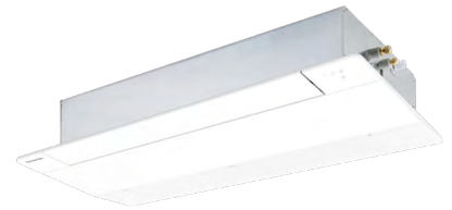
Hi - Res Image